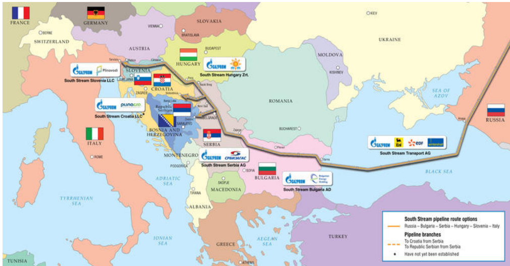
Fig. 1 South Stream Route 5

The project consists of two types of pipelines, offshore and onshore. The first segment is a 900 km offshore pipeline from the Russian shore in Anapa, passing the Turkish Exclusive Economic Zone of the Black Sea at a depth of 2000 m and exiting on the Bulgarian coast near Varna. From here begins the onshore segment, crossing Serbia, Hungary, Slovenia, until reaching Italy; additional branches for Croatia, Bosnia and Herzegovina are also included.