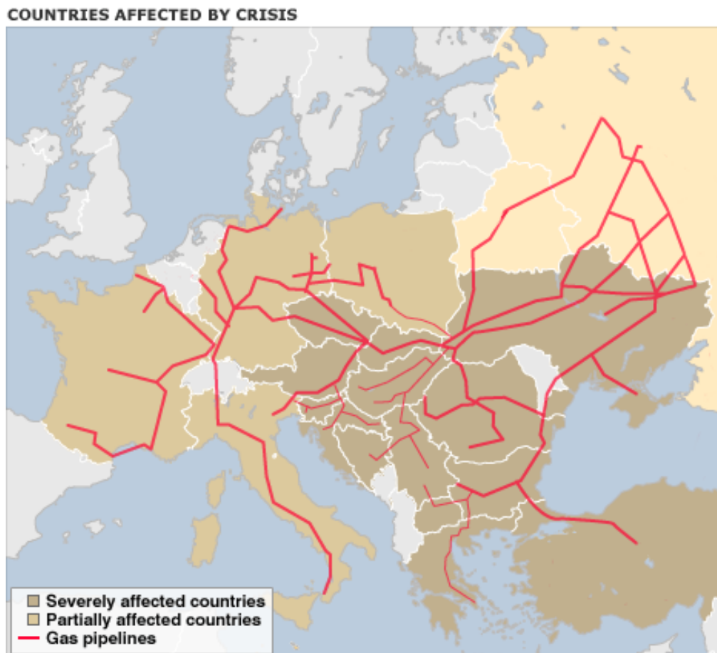
Fig. 3 Countries affected by crisis 17

After 13 January 2009, the gas flow started again but only for European consumers, bypassing Ukraine. However, as Russia accused Ukraine of blocking the gas transit, later on the Ukrainian President explained that a multiple pipeline system does not allow transportation in a specific direction. 18 More than that, the Ukrainian President Viktor Yushchenko said that Kiev is ready to ensure the transit of Russian gas to West if Moscow fully resumes fuel supplies to the Russian-Ukrainian border: “It demeans national pride, it demeans the honour of the state, where dozens of voices repeat that Ukraine committed a theft, without doing a single step to prove it in the context of arbitration, and to establish the truth through the courts. And that’s why we insist on the purpose of a European